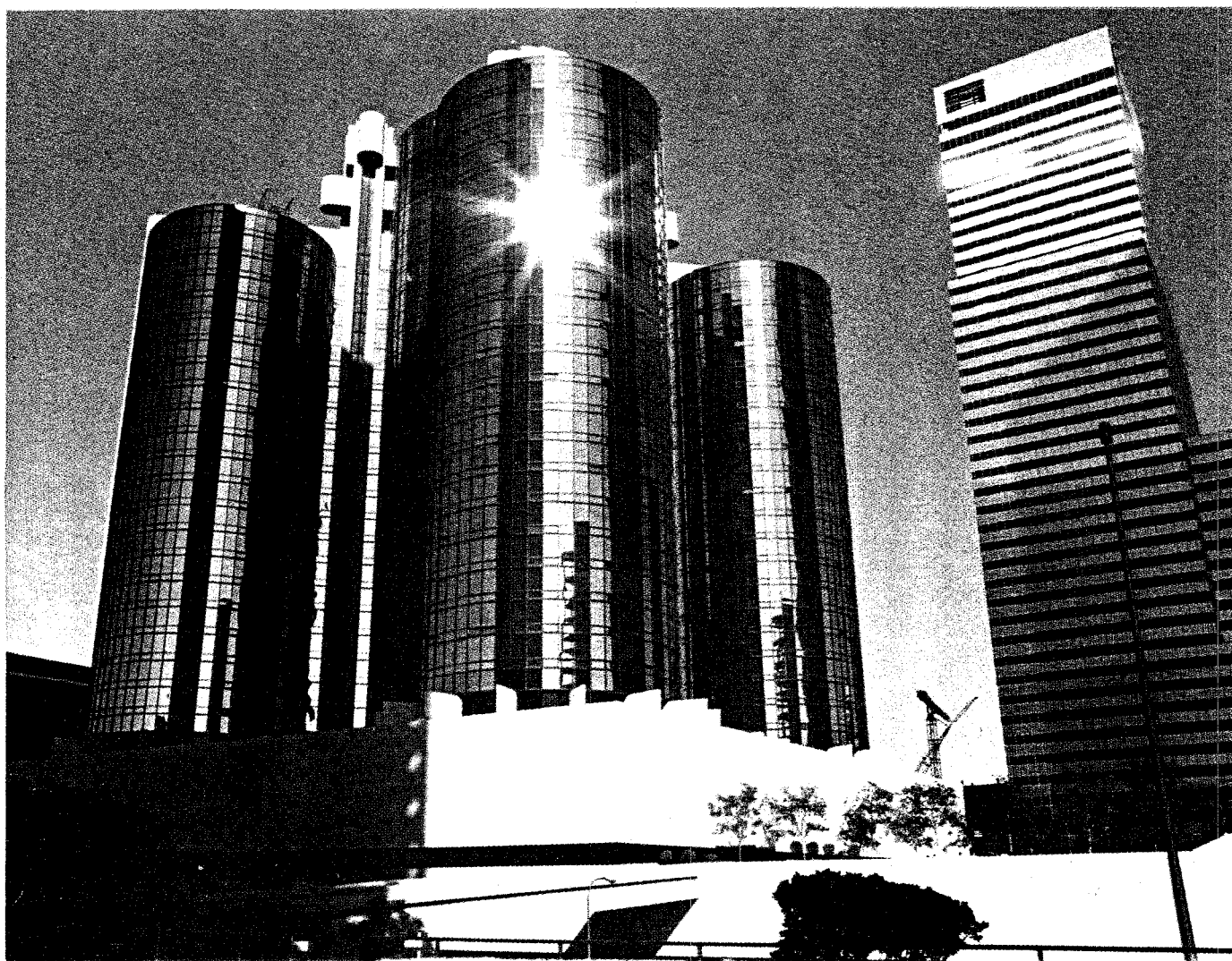
Bonaventure Hotel, Los Angeles, California